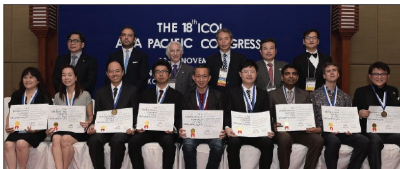
Diplomate recipients with ICOI and AP section officers.