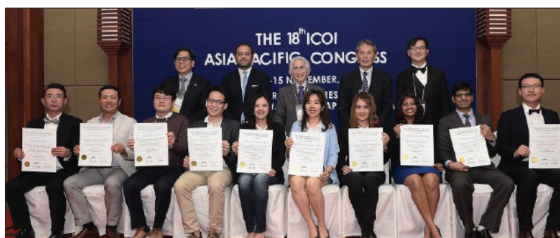
Fellowship recipients with ICOI and AP section officers.