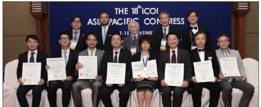
Fellowship recipients with ICOI and AP section officers.