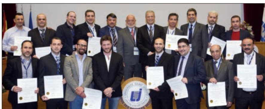
Lebanon Fellowship and Diplomate award recipients.

organizing an event of this scale in a country with such precarious surroundings. He retraced the obstacles and challenges in setting up this local chapter and stressed its inherent role in the evolution and improvement of the profession both locally and regionally.