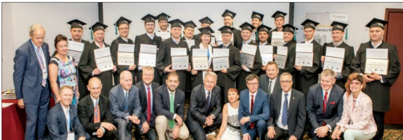
The Advanced Credentials' ICOI Fellowship and Diplomate Awards Ceremony was held on Saturday 13 June and was accompanied by Certificate Celebration for PSI members who successfully graduated educational program PSI/DGOI/ICOI Curriculum for Implantology in years 2013-2014.