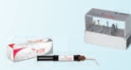
Attachment Processing Material