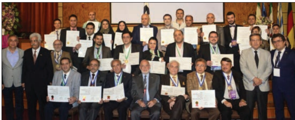
Tehran Fellowship, Mastership and Diplomate award recipients.